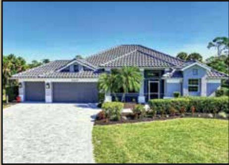
3020 Big Pass Ln $999,000

Stunning Estate Home completely updated inside and out! Attractive Seller Financing Offered!