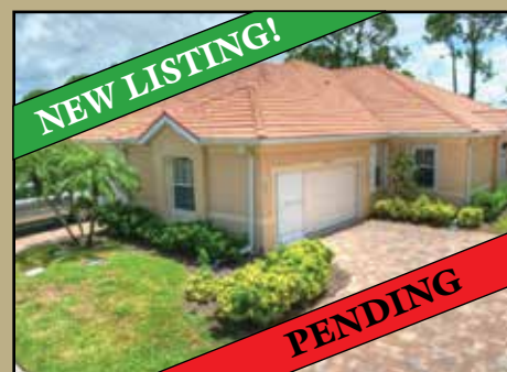
3780 Cobia Villas Ct $339,000

Immaculate 4 BR, 2 BA Home in the Beautiful & Popular neighborhood of Burnt Store Village