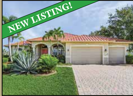
24276 Santa Inez Rd $699,000

Enjoy endless sunsets from your beautiful 5th level End unit with Seller Financing -call for details!