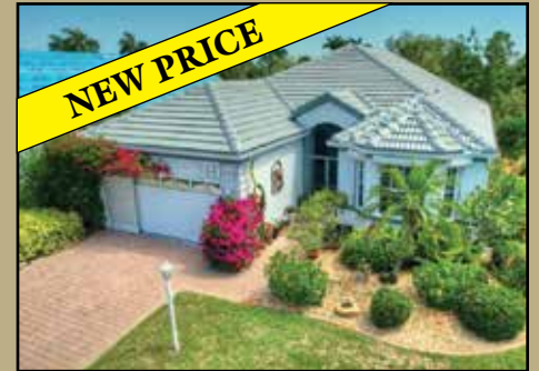
17844 Hibiscus Cove Ct $449,000

Features & upgrades you're looking for, Huge pool deck, plus extra long paved driveway & new Roof