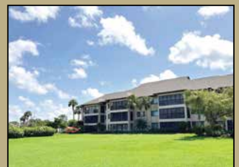
1600 Islamorada Blvd #74A $265,000

Available 1st Floor KEEL CLUB, beautifully maintained end unit condo sold turnkey, perfect get-away