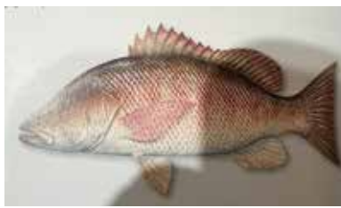
Mangrove Snapper.

• A second great hideout is the roots of mangrove plants along the shoreline. Usually, the plants located the greatest distance from the shore hold these fish. Don't be afraid to get your bait right in the mangroves, as the snappers will lie in waiting.