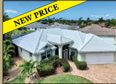
201 Big Pine Lane $495,000

Penthouse with million dollar views! Many updates and partially furnished at a great value!