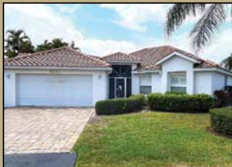
4041 King Tarpon Dr $530,000

Stylish custom-build home nestled in beautiful Burnt Store Lakes community with picturesque landscaping