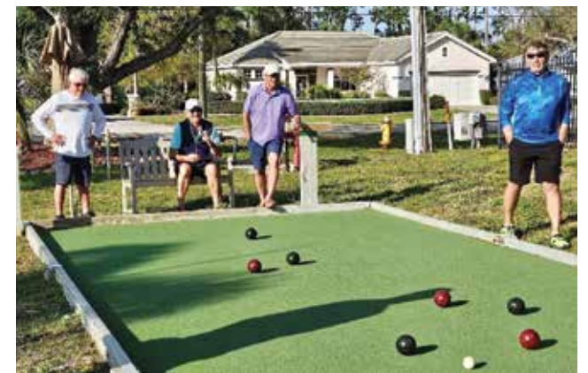
The guys talking strategy

The bocce court is adjacent to the northeast side of the parking lot at Burnt Store Marina Country Club. Beginning in November, play is every Tuesday, from 3 to 5 p.m., followed by dinner at Linkside Café, or another local restaurant. Dinner is optional, and you do not have to be a member of Burnt Store Marina Country Club to play bocce. There is a nominal fee of $1 per player collected each week for maintenance of equipment, and end of season party and prizes. You will find a welcoming group of bocce players every Tuesday. Grab your lawn chair and join the fun, or just come and observe to learn the game.