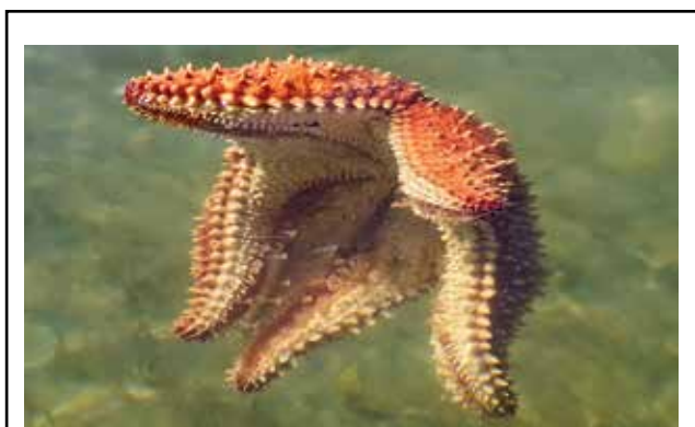
The seastar moves through water using its suction-bottomed tube feet to propel itself forward.