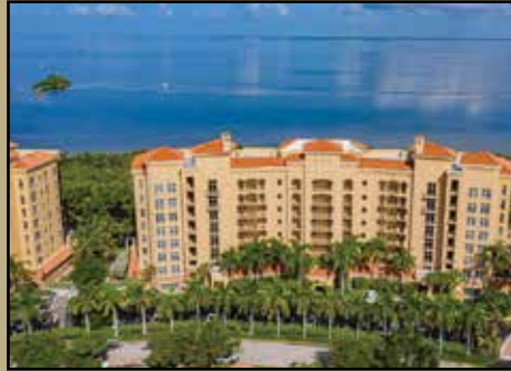
3329 Sunset Key Cir #401 $889,000

Stunning Estate Home completely updated inside and out! Attractive Seller Financing Offered!