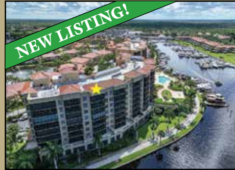
3221 Sunset Key Cir #708 $549,000

New Tile Roof with transferable warranty crowns this spacious and well maintained home.