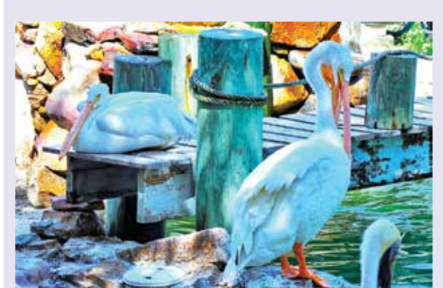
White pelicans are cared for at Punta Gorda Peace River Wildlife Center.