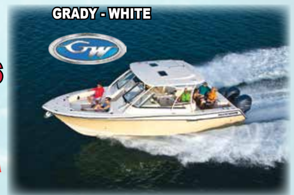
GRADY - WHITE