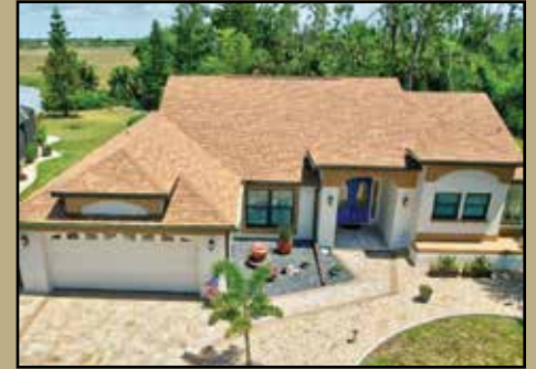
16681 Acapulco Rd $555,000

Spacious & Elegant Burnt Store Lakes Pool Home with three car garage situated on a corner lot