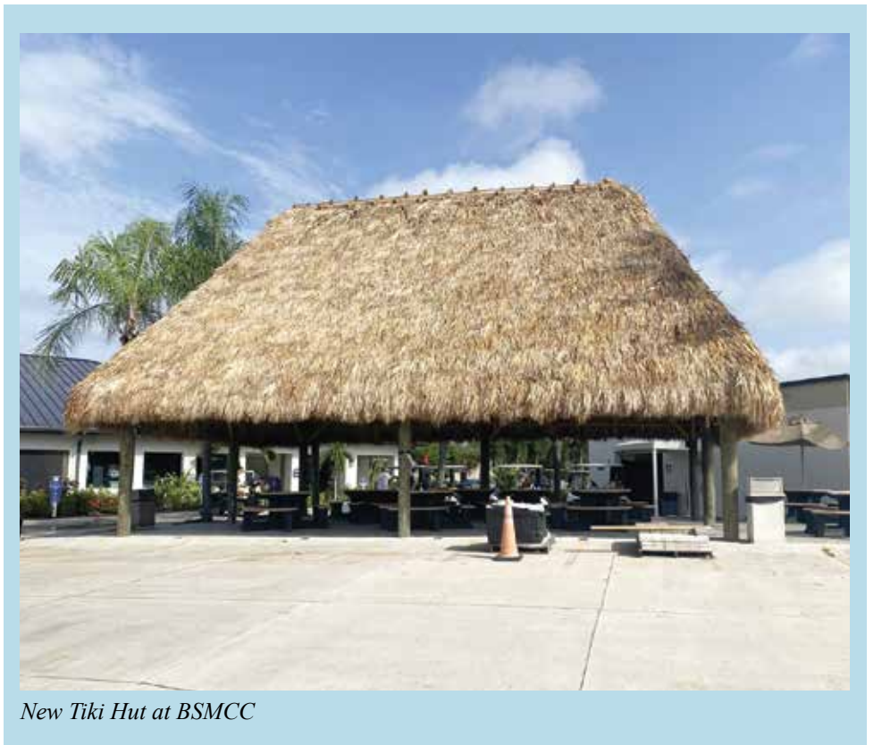
New Tiki Hut at BSMCC