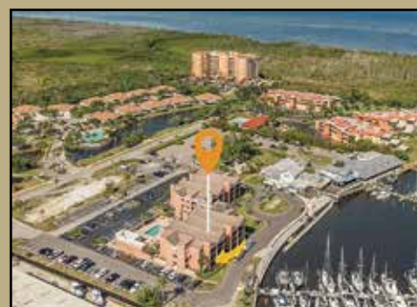
3160 Matecumbe Key Rd #218 $277,000

Beautiful Turnkey Furnished Condo - Clean and updated, 3 BR, 2 BA, 2 Car garage with hurricane shutters