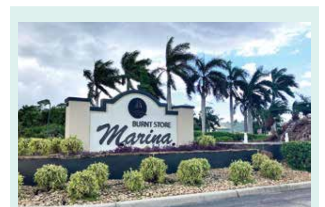
New signage at front gate of BSM.