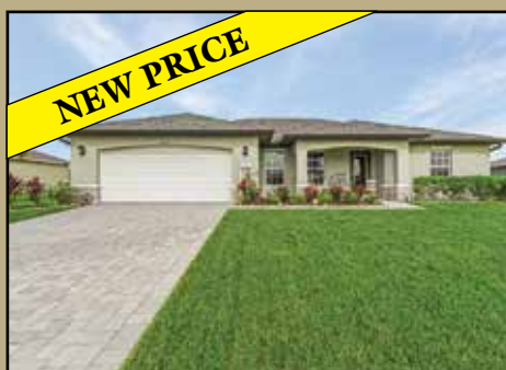
25475 Doredro Dr $427,000

Contemporary furnished home with Den in the Heart of the Marina on a quiet cul-de-sac