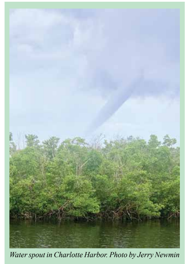
Water spout in Charlotte Harbor.