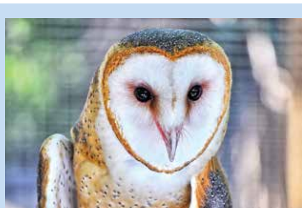
Barn Owl at Punta Gorda Peace River.

We are inching closer and closer to making our dream of a BSM Dog Park a reality. For more information about the BSM Dog Park, please to the BSM22.org site and look under amenities.